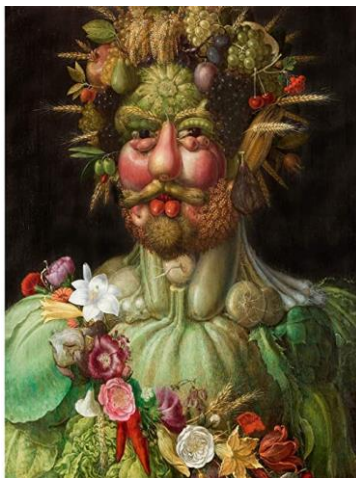
Feast for the Eyes