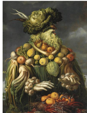
Autumn Beard Man